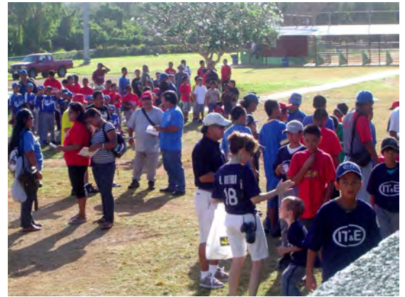
Teams and fans at the Saipan Little League opening ceremony